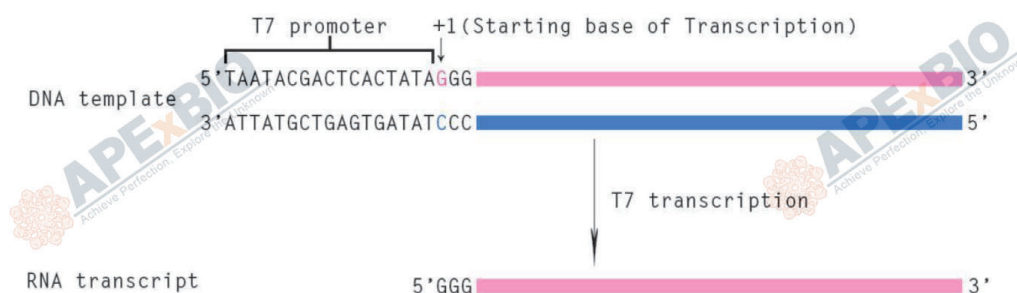
Figure 1: Transcription using T7 RNA Polymerase

PCR DNA product, linearized plasmid DNA, cDNA and oligonucleotides can be used as templates for in vitro transcription. Many cloning vectors carry two opposite T7 phage polymerase promoter sequences that bind T7 polymerase to initiate the transcription process. To obtain a purified linearized plasmid, the plasmid as a transcription template by digestion with restriction endonuclease treatment must be cleaned up. Figure 1 interpret how the T7 RNA Polymerase transcript to produce RNA with T7 promoter.